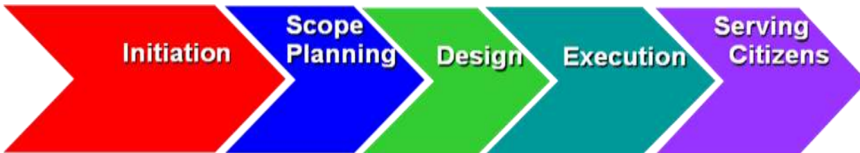
Figure 1. FY07 IOWAccess Project Lifecycle

Phase 1 - Initiation – This requires the investment of a small amount of resources, resulting in a reliable estimate of the cost of gathering and documenting detailed requirements. The initiation phase can be completed at no cost to either the IOWAccess revolving fund or the customer (in this case the state agency or branch of government), other than the time needed to complete the deliverables. Consequently, no IOWAccess funding is used for the initiation phase . The deliverables from this phase include a concept paper generally describing the e-Government process or application and a cost estimate for completion of the planning phase.